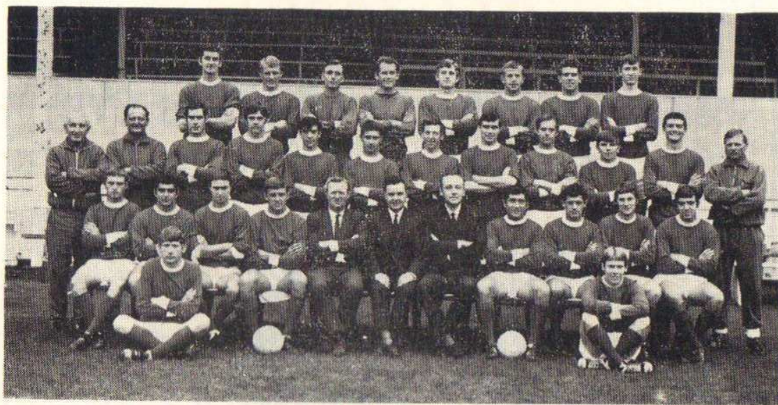
SWINDON TOWN, 1968/69